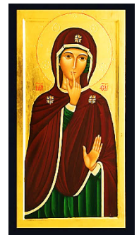
Our Lady of Silence, Pray for us.

We ask that people will observe a respectful silence in the Cathedral before and after Mass. Many people come to pray before and after Mass and have asked that silence be observed. Jesus is present in the Tabernacle and we should give Him due honor and respect. We have the advantage of having some good space outside the cathedral in the hallway leading to the Bishop Marshall Center to carry out fellowship and conversation. Thank you so much for giving your attention to this matter.